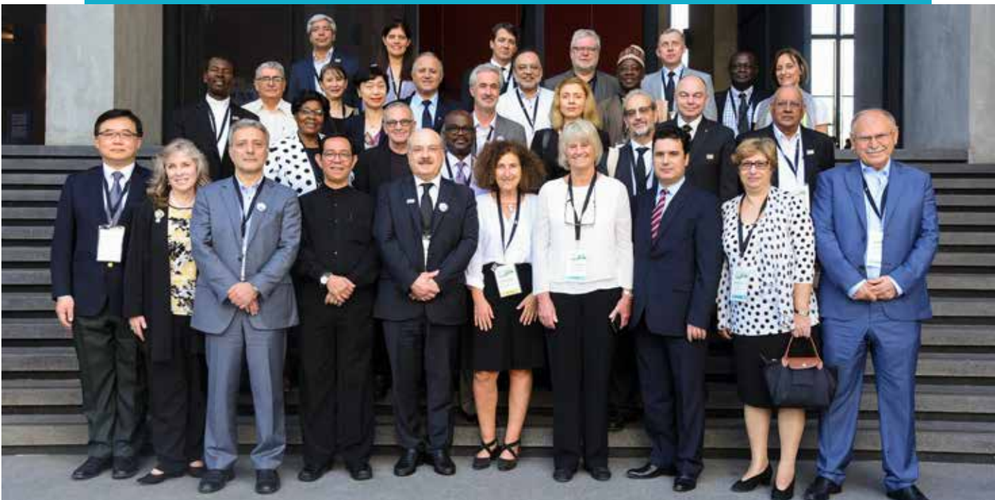
Newly elected IAU Administrative Board 2016-2020.

The General Conference is the supreme decision-making body of the Association. It meets once every four years and in addition to electing the IAU President as well as the Administrative Board members, IAU Members adopt the strategic direction for the Association. In November 2016, during its 15 th General Conference in Bangkok, Thailand, the IAU Members elected the new IAU President and Administrative Board to serve from 2016 until 2020.