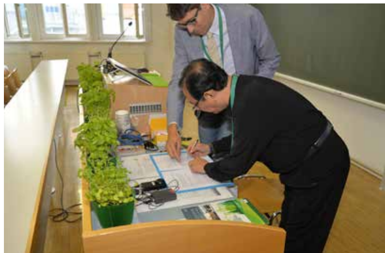
The presidents of IAU and COPERNICUS Alliance sign the Memorandum of Understanding (MoU), Vienna 2016.

During the Vienna COPERNICUS Alliance 2016 International Conference in September 2016, the IAU and COPERNICUS Alliance signed a Memorandum of Understanding (MoU). Signed by the presidents of both Associations, this MoU is built on a