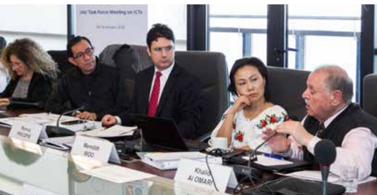
IAU Task Force on ICTs.