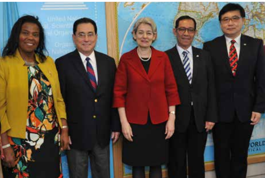
IAU Executive Committee with UNESCO Director General (in the middle).

Based in UNESCO headquarters in Paris, IAU continues its close collaboration with UNESCO in several areas. This section contains highlights from this year's collaboration.