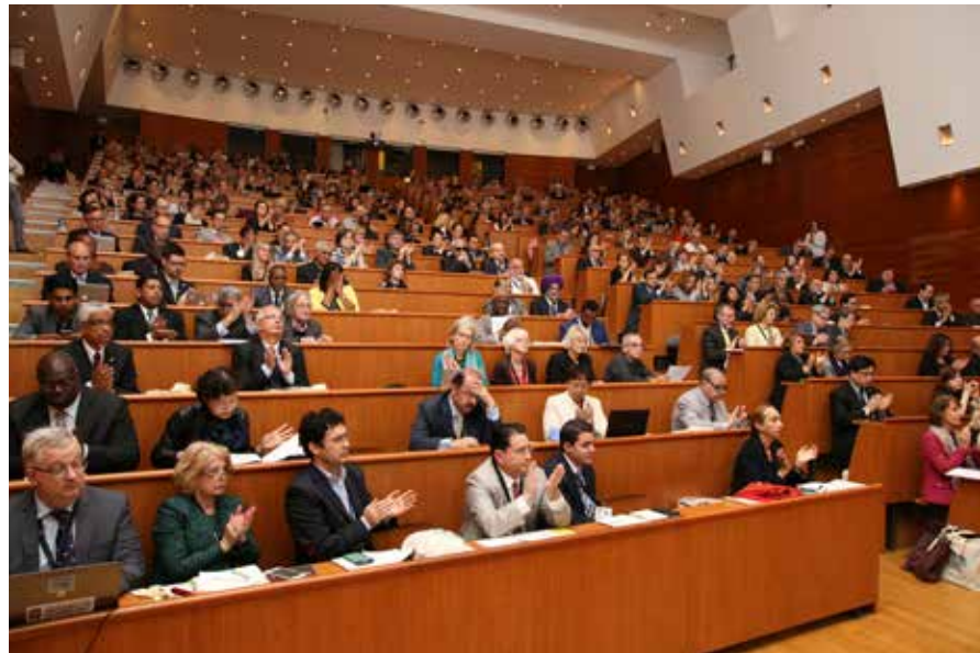
LEFT Networking during the IAU 2015 International Conference RIGHT IAU 2015 International Conference in Siena

Internationalization of Higher Education: moving beyond mobility was the theme of the IAU 2015 International Conference hosted by the University of Siena in Italy in October 2015. 400 participants from more than 80 countries came together to deliberate and share their views and perspectives on the strategies and purposes of higher education internationalization and to determine how to include other actions - beyond mobility. The Conference took place in an historical and picturesque setting in Siena.