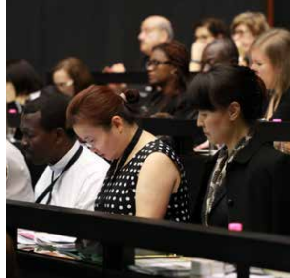
IAU 15 th General Conference in Bangkok.

A comprehensive report on the IAU 15 th General Conference will be included in next year's Annual Report as it took place in the 2017 IAU reporting year. However as this important Conference has already taken place when this report is being prepared, it was decided to include a short presentation of this important event in the life of the Association here. The newly-elected President and Administrative Board are presented above, in the Governance section along with the new strategic plan adopted during the General Conference.