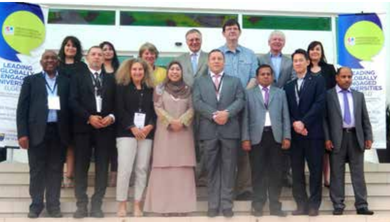
First LGEU cohort in University of Malaya, Kuala Lumpur