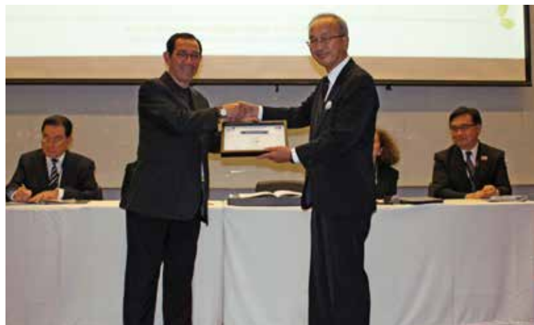
IAU President hands the ISAS (2.0) Learning Badge to the President of Hokkaido University during the IAU 15 th General Conference in Bangkok, Thailand